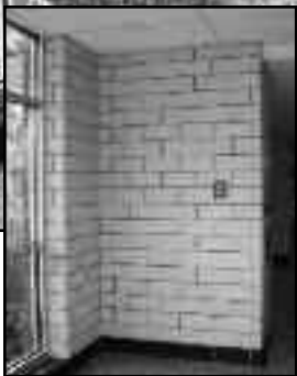
(left & Above) Before and After.

“Acceptance, Tolerance, Forgiveness... These Are Life-Altering Lessons” is the quote by Jessica Lange that was chosen as the theme of the latest mural project to be done by the students at David Brearley Middle/High School. Inspired by an anti-bullying assembly, a group of middle school students asked their language arts teachers to help them create a visual anti-bullying statement. With the assistance of the art department, teachers and students are transforming a school hallway and courtyard into an inspirational environment that includes a mosaic wall, columns and an 11-foot mosaic tree sculpture, all filled with positive messages written by the students.