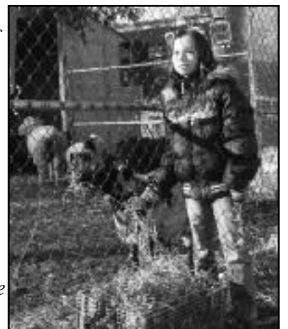
(left) The recreation of the Nativity Scene presented by teens from St. Theresa's Youth Ministry after the Midnight Mass.