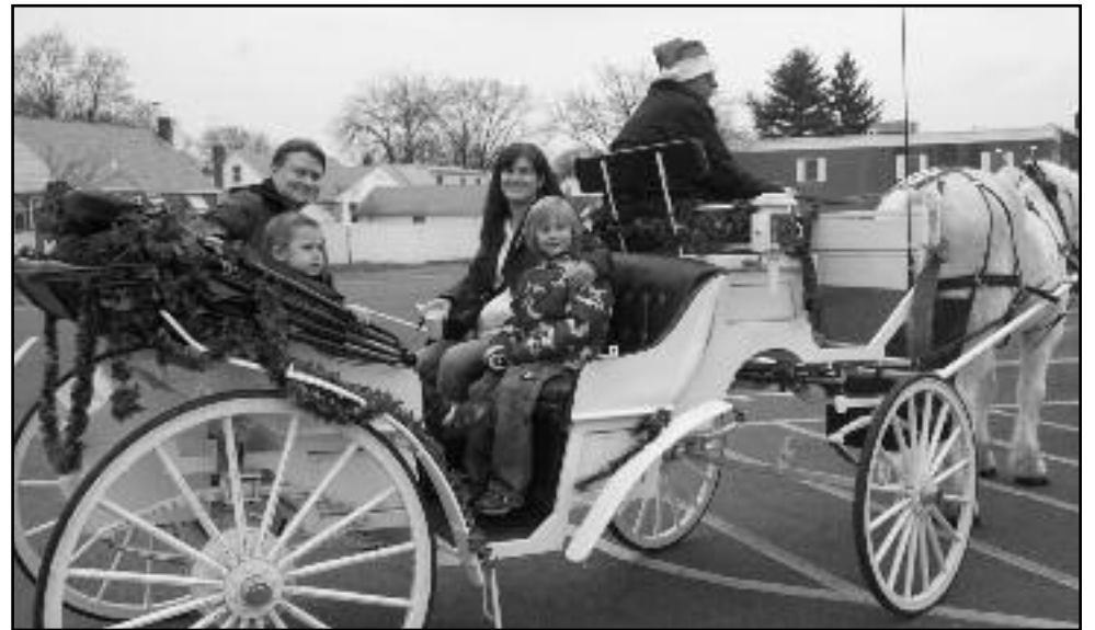
(above) Sammet Family enjoyed a carriage ride