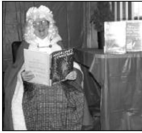
(above) Mrs. Clause kept busy reading Christmas books.