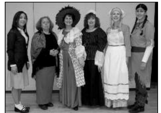
(above) History is alive at East End School.

history from Native Americans to the first children who attended East End School to the present day multi-cultural population.