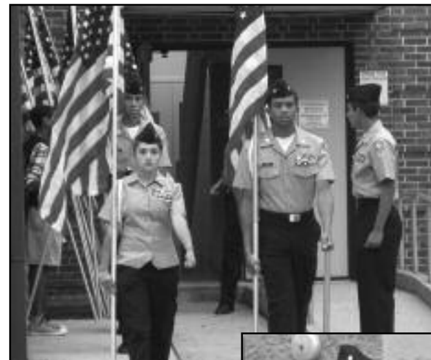
(above) Members of the North Plainfield JROTC march in the Avenue of Flags ceremony.