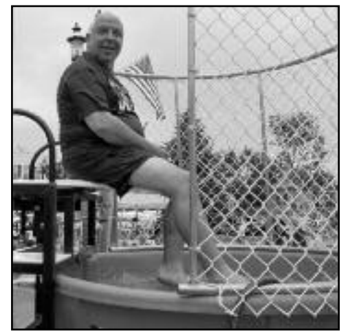
(above) The North Plainfield Lions Club hosted a beer garden at the fair.