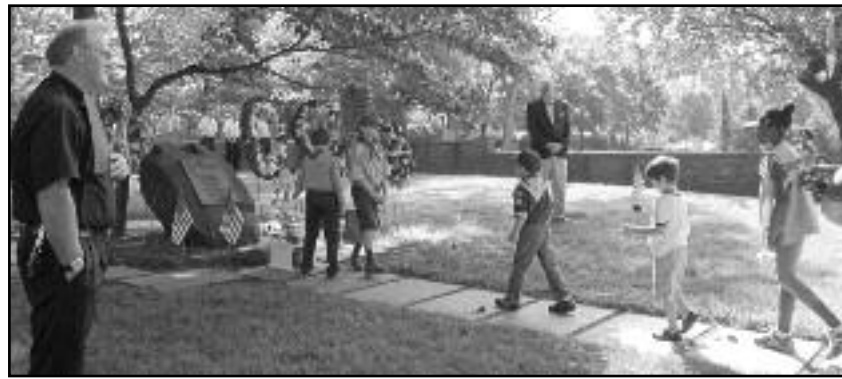
(above) Young scouts take part in the "Walk of the Children", placing flowers on a grave site in loving memory.