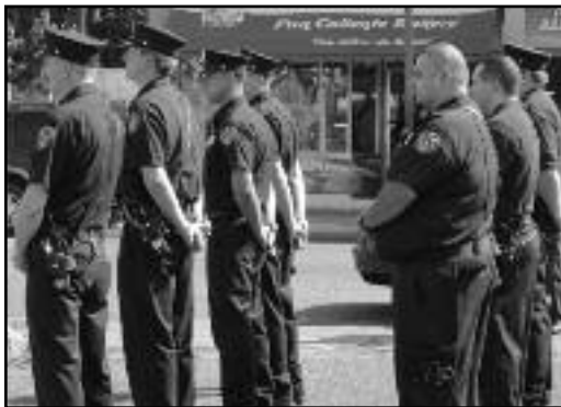
(above) Members of the NP Fire Department and EMS gather at Fire Bell Ceremony on Somerset Street.