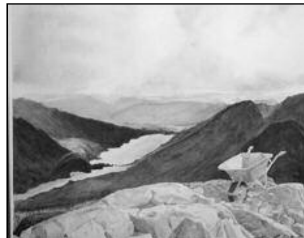
(above) Landscape Painting by WHRHS student, Olivia Hampton.

For more information visit our website at www.watchungarts.org or to place a reservation call 908-753-0190 or email atwacenter@optonline.net . The Watchung Arts Center is located at 18 Stirling Road, Watchung, NJ 07069. The Watchung Arts Center's Gallery and office hours are 12 - 3 PM, Wed - Fri, and Sat by appointment.