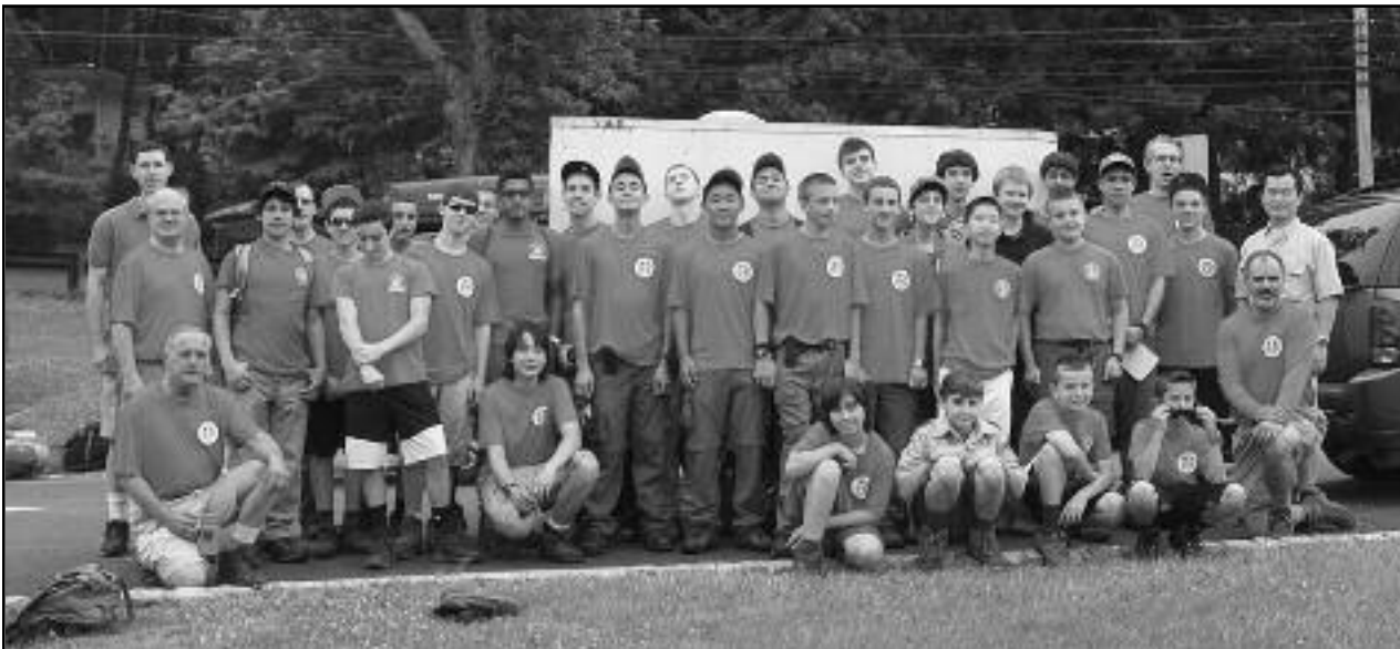
(above) Scouts departing on their main summer camping trip to Sabattis in upstate NY on June 29, 2013. Twenty-eight scouts from the Troop attended, in addition to 6 adults. A week at Sabattis Adventure Camp is one of the highlights of their scouting career, where they can relax in the middle of the Adirondacks, work on rank advancements, merit badges and other activities, as well as working closely as a patrol and troop.