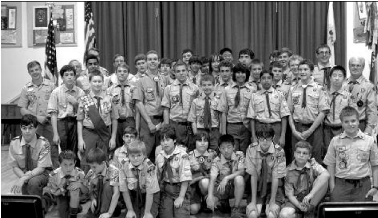
(above) Boy Scout Troop 228 in attendance for Court of Honor held June 10th. The Court of Honor is where all rank advancements are officially recognized, as well as presenting of merit badges and other miscellaneous awards since the previous Court of Honor.