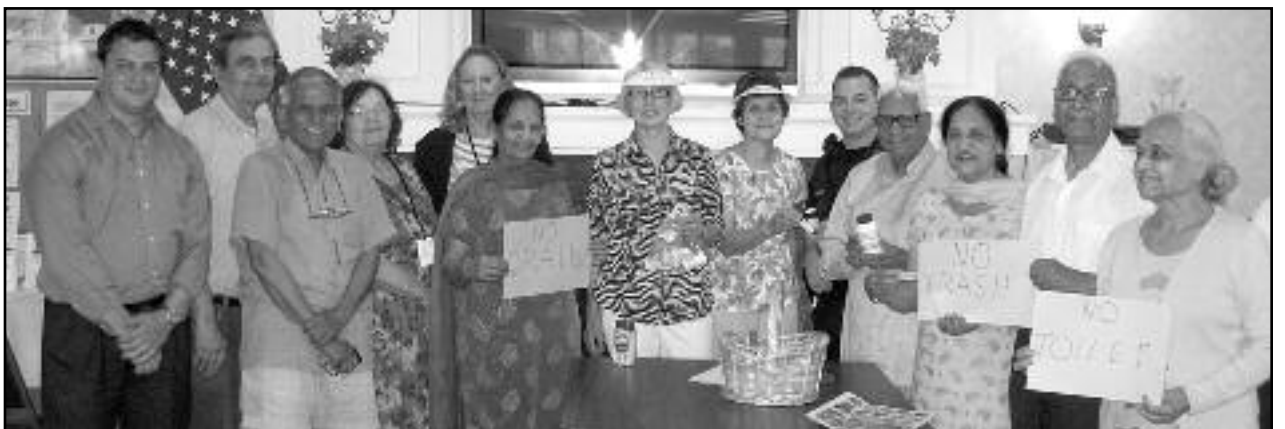
(above) Prescription Drug Abuse Prevention Program presenters and attendees.