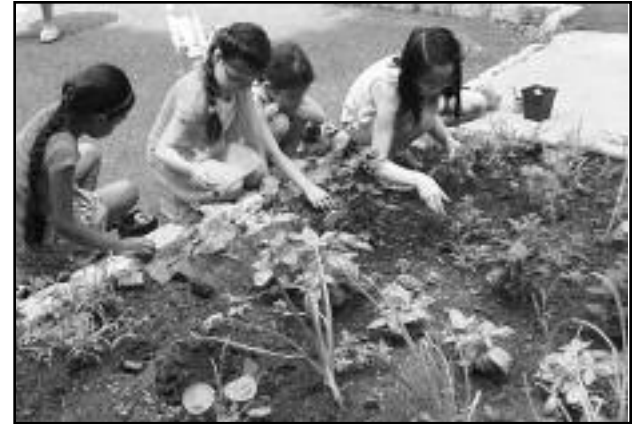
(above) Children Help Weed Watchung Library's Herb Garden.

The Philadelphia Zoo brought several live animals and animal artifacts to introduce readers to amazing world of underground creatures. Other animals included a legless lizard, a rabbit and a burrowing owl (for those of you who read Hoot by Carl Hiaasen).