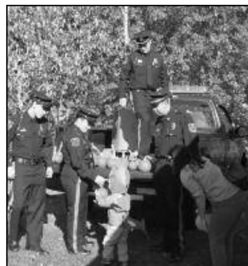
(above) The Long Hill Police Explorers hand out sugar pumpkins to all participants in costume. Pumpkins and goodie bags donated by Hillview Farm of Meyersville.