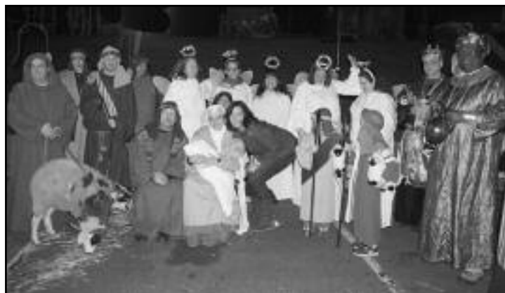
(left) A live Nativity scene was created by Crossroads Christian Fellowship Church and families were invited to pose for pictures.