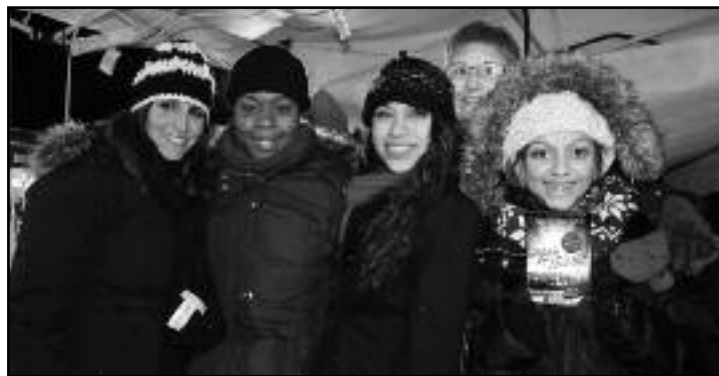
(above) Refreshments were served up by the Union High School Performing Arts Club.

PRSR STD-A US POSTAGE PAID Permit #1081 Newark, NJ