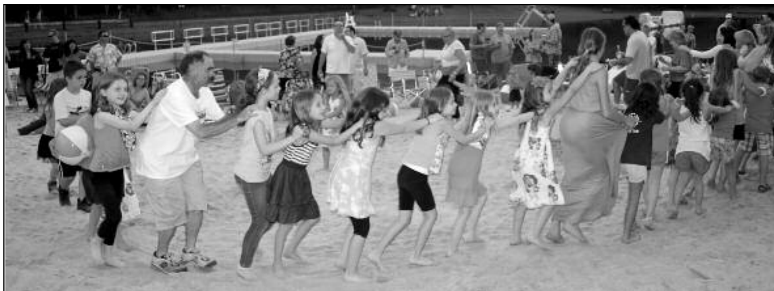
(above) Concert-goers having fun and enjoying the beautiful evening.