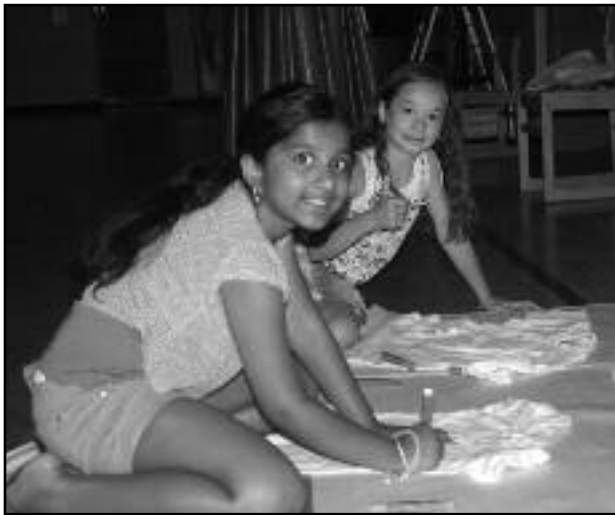
(above) These campers are designing "Cosmic tee shirts."

We are always looking for people interested in history to join our group!