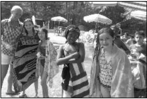
(above) Campers "Splashdown" at Green Brook Swim Club