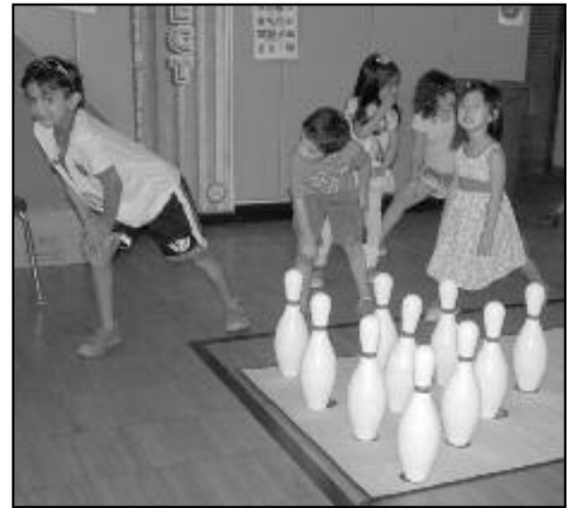
(above) Cosmic bowling was a big hit!

ACT NOW! 0 MONEY DOWN, 0% INTEREST, AND 0 PAYMENTS UNTIL 2015