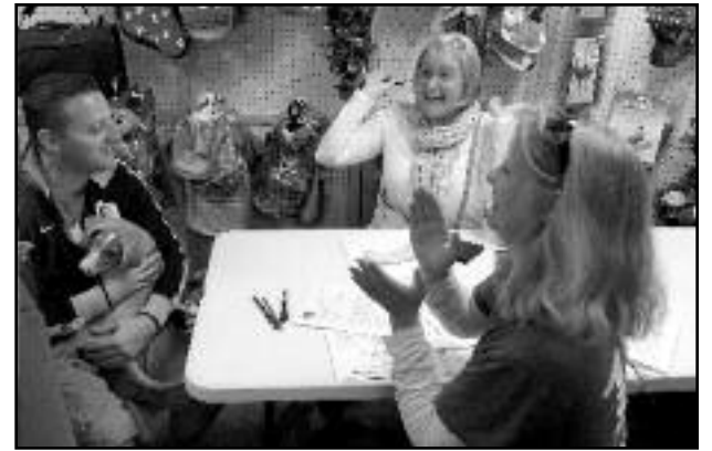
(above) Members of the Perrone family react with surprise upon being informed they are adoption number 4,000.

The 100-percent foster-based Home for Good