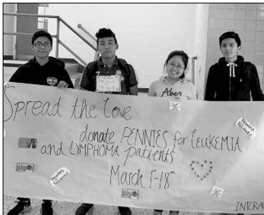
(above) North Plainfield High School Interact Club members display one of the banners that they created to raise awareness for the Pennies for Patients project.

PRSR STD U.S. POSTAGE PAID PHILA PA 191 PERMIT NO. 7575