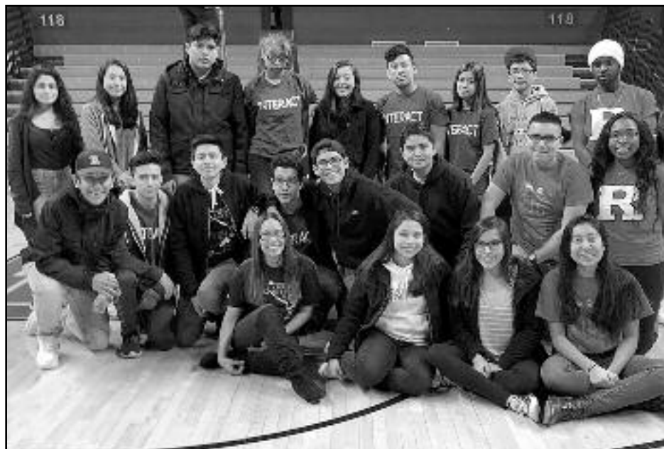
(above) North Plainfield Interact Club members pose for a group photo at the Rutgers Athletic Center before working the concessions stands at a recent basketball game.

The Rotary Club of Plainfield-North Plainfield welcomes new members who have an interest in serving others while developing new friendships. The club meets Wednesdays at 12:15 PM in Giovanna's Restaurant, 1462 South Avenue, Plainfield. Come as a guest and see what Rotary is all about.