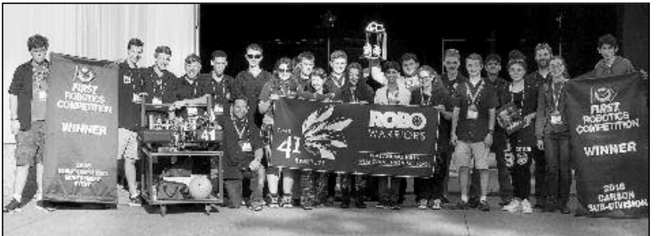
(above) WHRHS Team 41 Robotics Team

This year's Team 41 robot as seen from above, with a boulder on board, which could be flung by catapult at a tower window target to score points. The robot needed to contain its computer brain for remote control, propulsion mechanisms, and other mechanisms, such as the hydraulic piston that gives the catapult power. The bot had to be relatively quick, nimble, durable, with its vital components protected and easily repaired if the rough and tumble of competition caused damages.