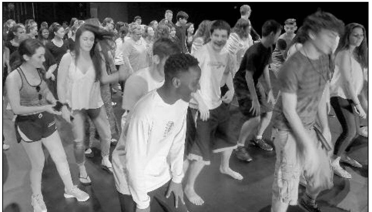
(above) For the grand finale to Dancing With the Teachers, all were invited, including the audience, to get up on stage to participate in the last dance number, the currently popular funky line dance, "The Cha Cha Slide."