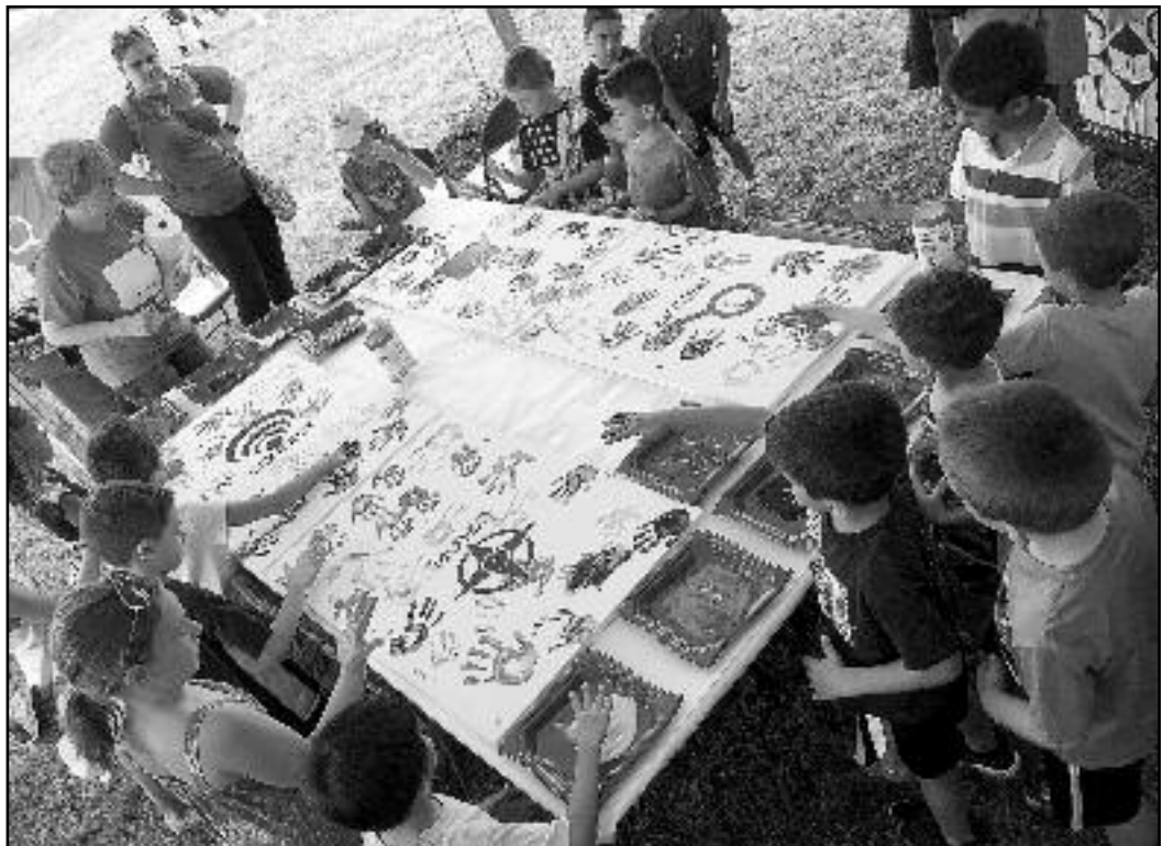
(above) Children participating in the creation of the Somerset County Community Mural which will be on tour to all of the Somerset County libraries

The County Agricultural Department presented the same idea for a mural,