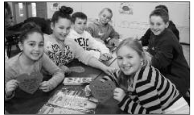
(above) 4th and 5th grade K-Kids members with their Valentines.