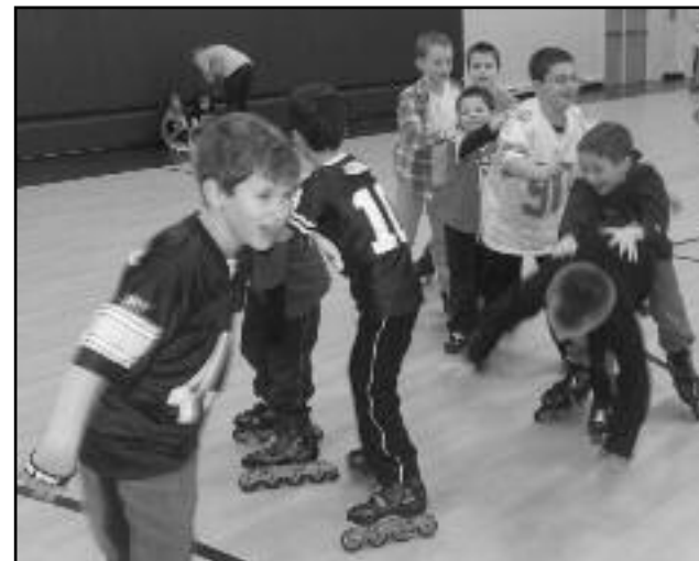
(above) Friday nights at Clark Recreation are fun and moving as the gym turns into a roller skating rink for Clark grammar school children. The program is free to Clark residents and is offered every Friday from November thru April.