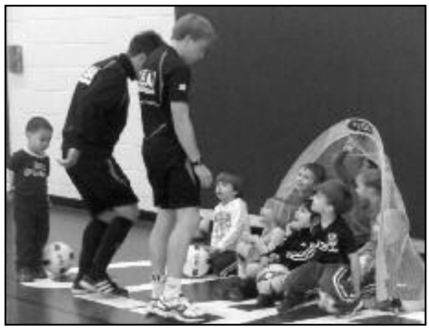
(above) Sport Squirts – instructors from the US Sports Institute focus on a particular sport and do drills and techniques with the preschoolers ages 3-5.

Tail Lights • DoorsFenders • AC Compressors