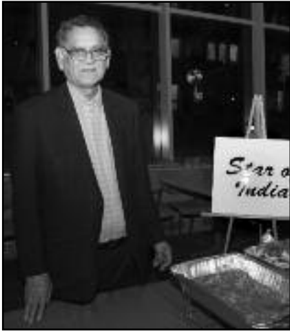
Armar, Star of India