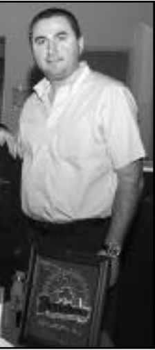
with staff at & Irish Pub

Color photos can be seen, downloaded and prints can be purchased at www.picasaweb.google.com/joerenna1