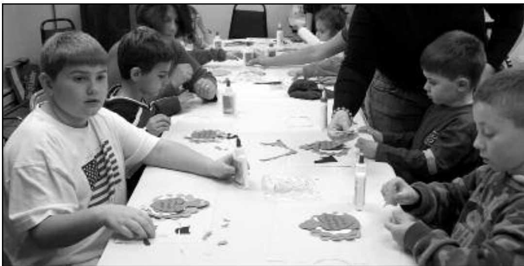
(above) Kenilworth Library Thanksgiving Day Craft