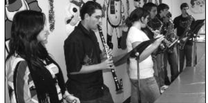
(above) Students performed Chrismas tunes.

This very active group has a car wash which is their major fundraiser for the year. The members all work hard on a Saturday in October to raise the funds for their projects during the year.