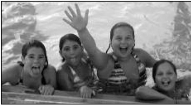
(above) Softball Swim Party July 1. (right) Patriot Game June 5.