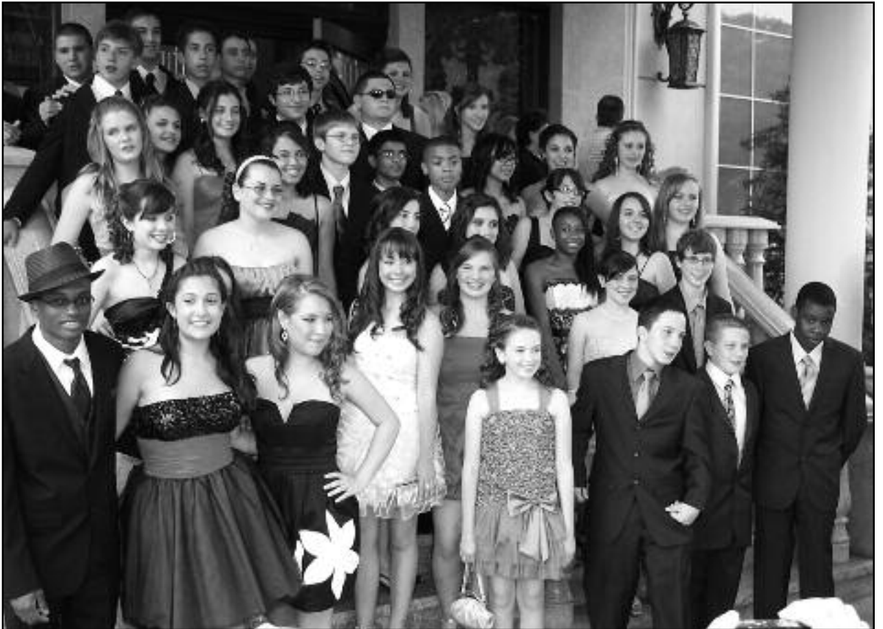
St. Theresa School in Kenilworth 8th Grade Class of 2010 enjoyed a night of dancing at the Galloping Hills Catering in Kenilworth, Friday June 4th.

For more photos visit Kenilworth Recreation on Facebook