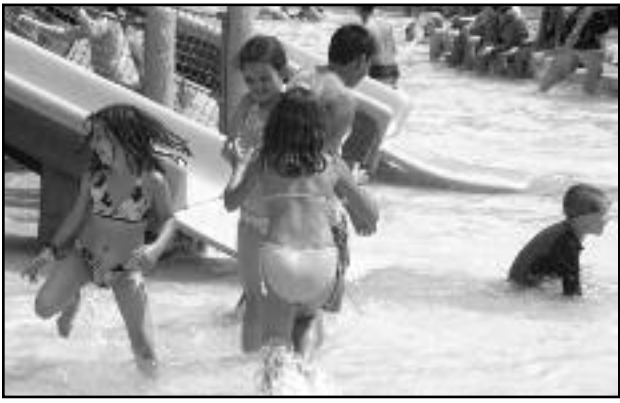
(above) Land of Make Believe June 25th