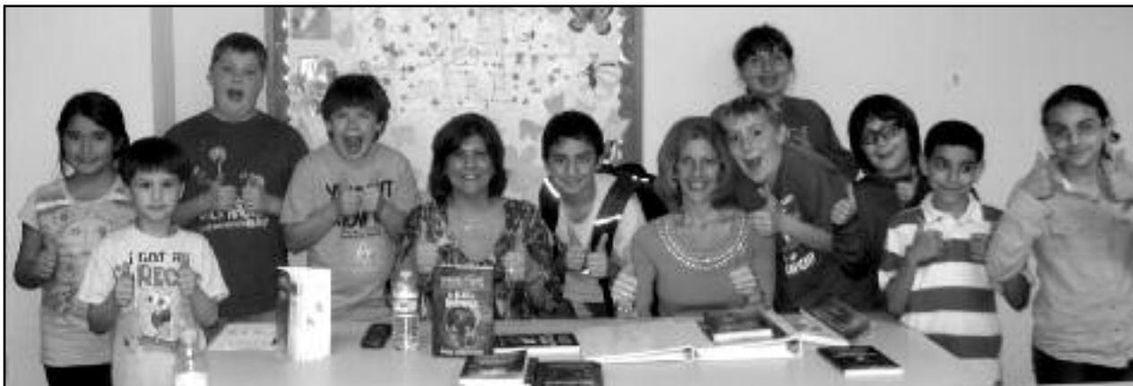
(above) Some of the children attending this event posed for a picture with the authors.

from the first book in this series, Grave Secrets , and also view a portion of the movie. Following the event, children visited with the authors, and also had an opportunity to have a personal copy of the book signed.