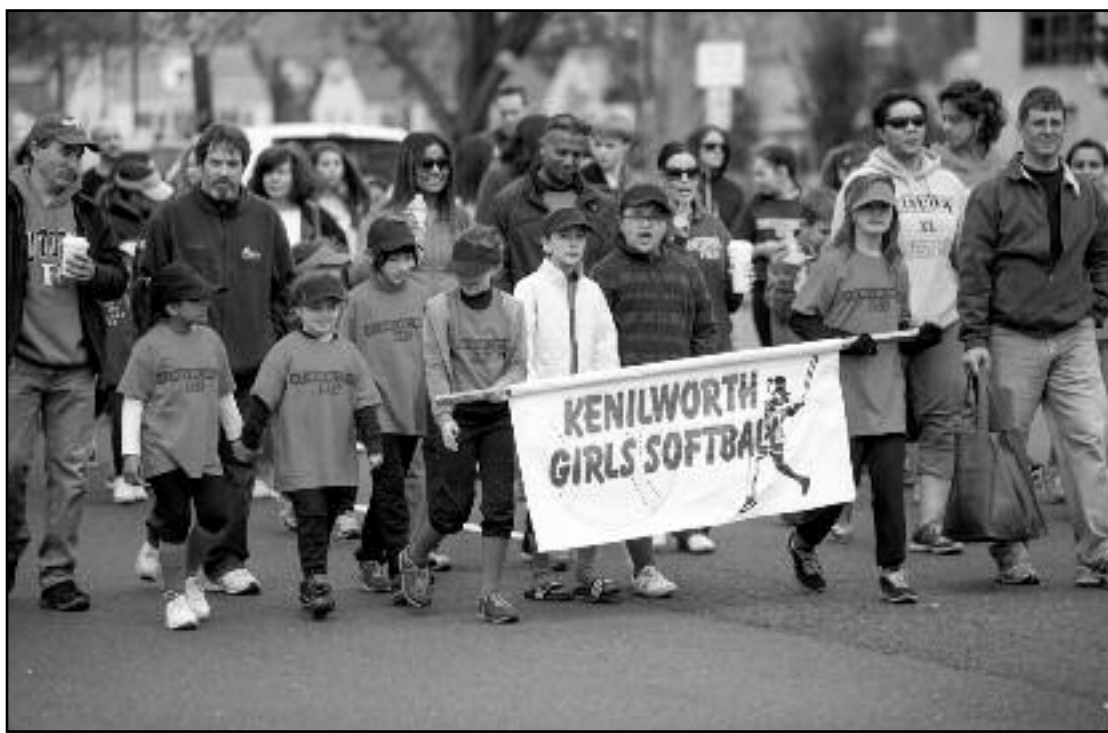
(above) Players and parents march in opening day parade for Kenilworth recreation spring season