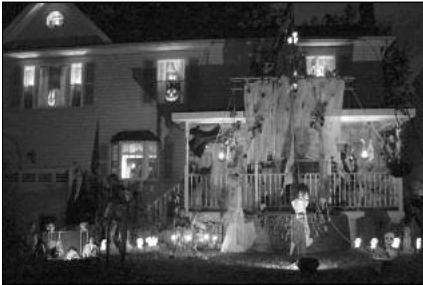
(left) 21 N.13th St.

Two honorable mentions will receive varied gift cards from Best Buy and Chili's, 617 Richfield Ave and 23 Commonwealth Rd.