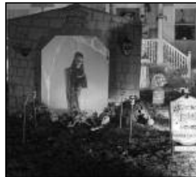
(below & right) 88 Park Dr.