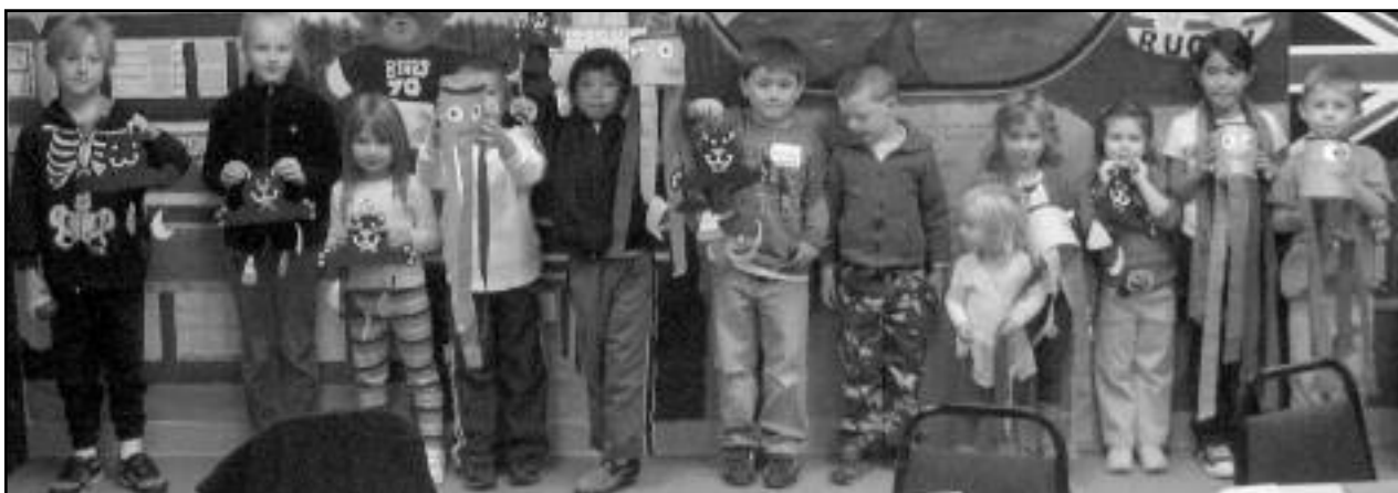
(above) Children display their completed Halloween crafts.

Children recently had an opportunity to create a Halloween craft at the Kenilworth Public Library to take home and display.