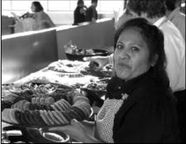
(above) Schering-Plough donated the use of their cafeteria as well as all refreshments – the volunteers were even treated to lunch!