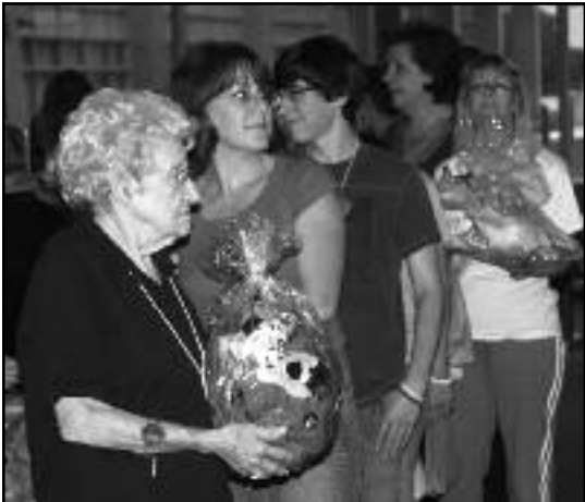
(above) It took 20 volunteers to move prizes from the tables to the winners.