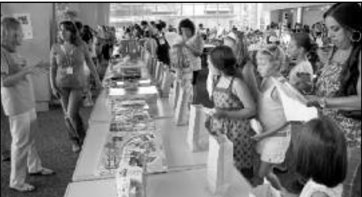
(above) A total of 257 prizes prizes were auctioned off and 47 consolation prizes were given away.