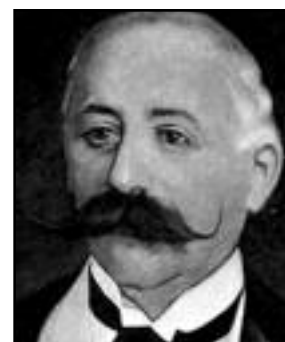
Baron de Hirsch

except July and August, starting at 7 p.m., at the Kenilworth Seniors' Center. Visitors are welcome.