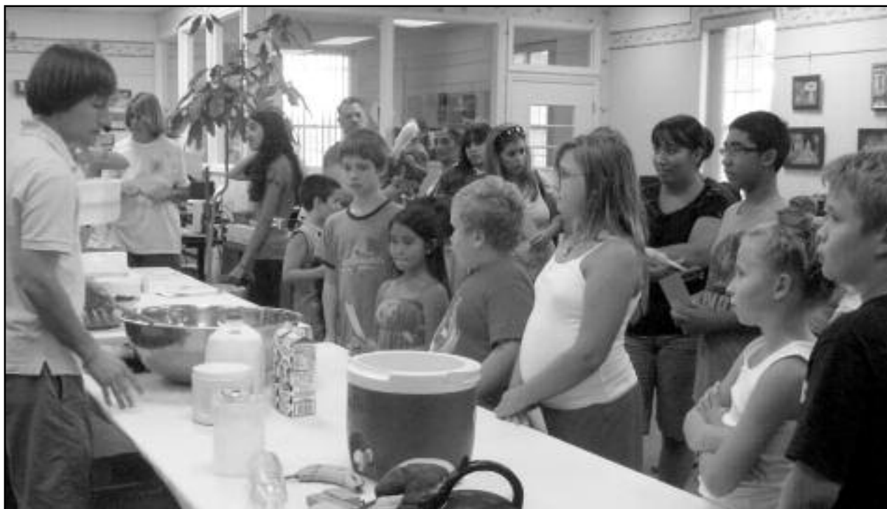
(above) Wondergy representatives present an edible science program teaching children how ice cream and cotton candy are made.

The Summer Reading program concluded on Friday, August 6th.