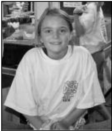
More photos can be found on KFD Facebook page: Kenilworth Fire Rescue (Kenilworth, NJ)

High School Cheerleading and Soccer, Kenilworth Pop Warner Football, and the St. Theresa's Pro Life Association. We could not have made it happen without your extra help. We would also like to thank everyone who came out and supported us. Thank you again and we will see you next year.