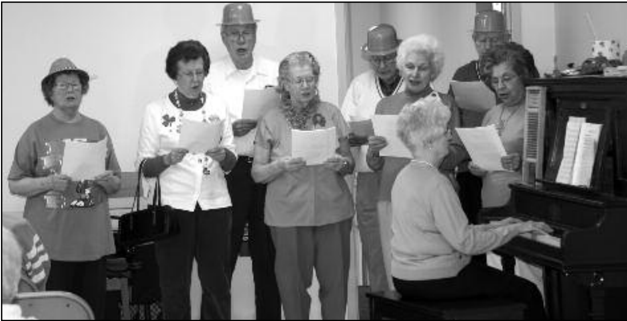
(left) Every third Tuesday of the month the Kenilworth Senior Citizen's Club has a birthday party for members, lunch and cake are served. March's party coincided with St. Patrick's Day. Senior's sang Irish songs.