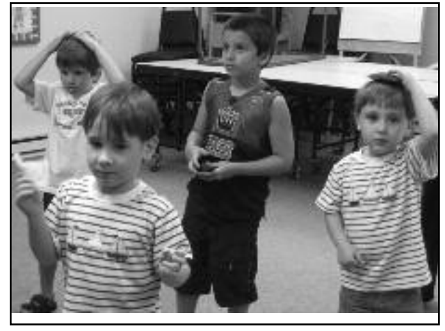
(above) Bean bag fun during story time.

Children ages 3 and up participated in a story time session which included bean bag activities and bubbles to pop.