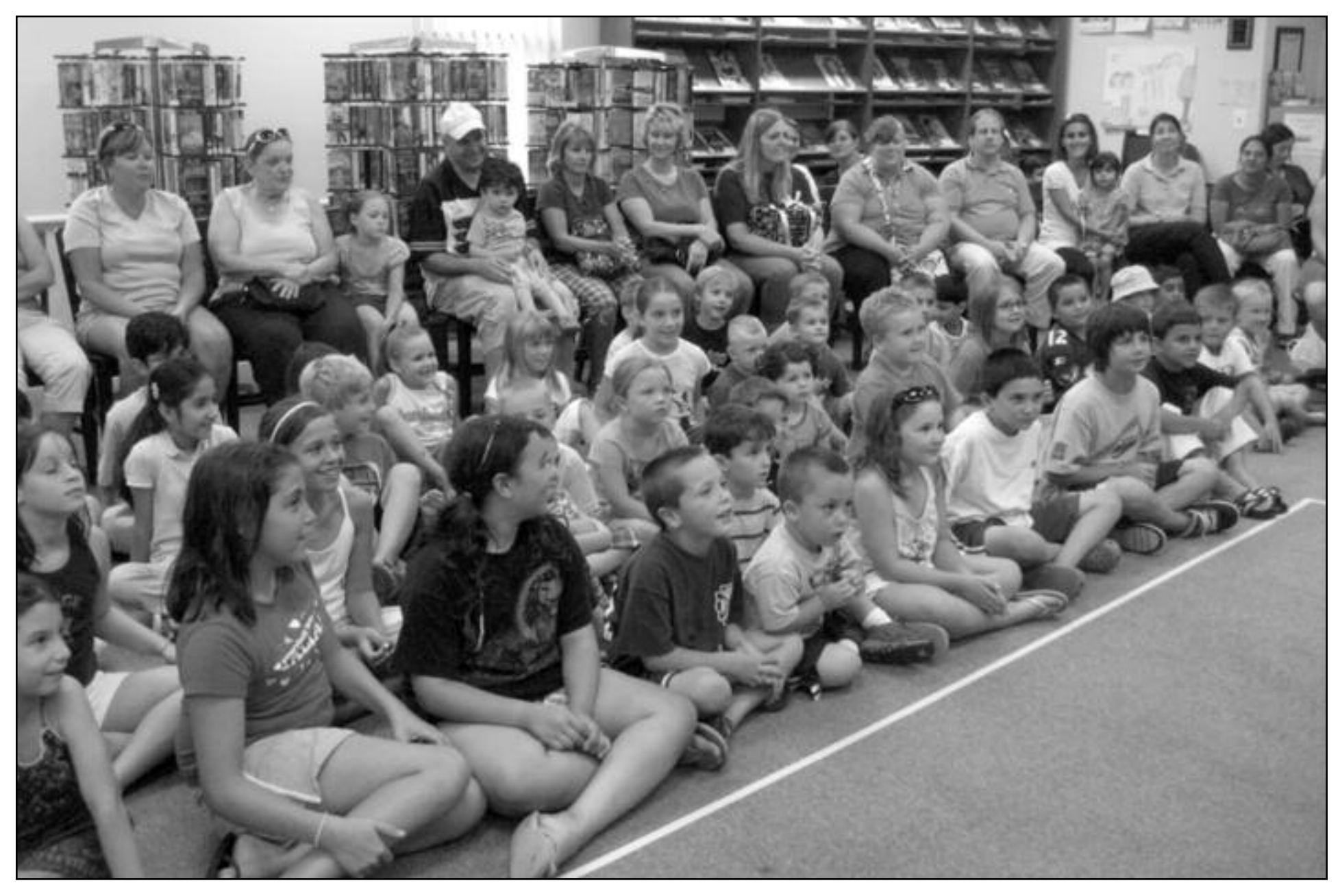
(above) A huge crowd of children and parents enjoyed the music and stories of Storytime Stage performers.