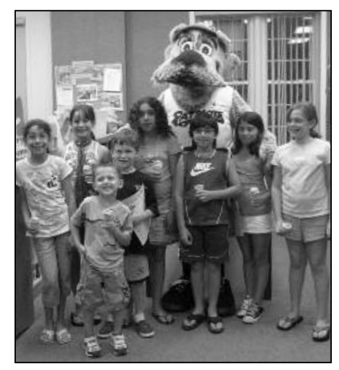
(above) Children enjoy ice cream with Sparkee the mascot from the Somerset Patriot's minor league baseball team

The concluding experiment, included various ingredients, and liquid nitrogen. His experiment provided a delicious ice cream treat for the entire audience. Following the program, children visited with Sparkee, the official mascot of the Somerset Patriots.