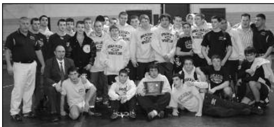
(above) David Brearley wrestlers after defeating Hanover Park 40-21 in the State Sectional Championship match.

Presort STD U.S. Postage PAID Kenilworth, NJ Permit No. 20