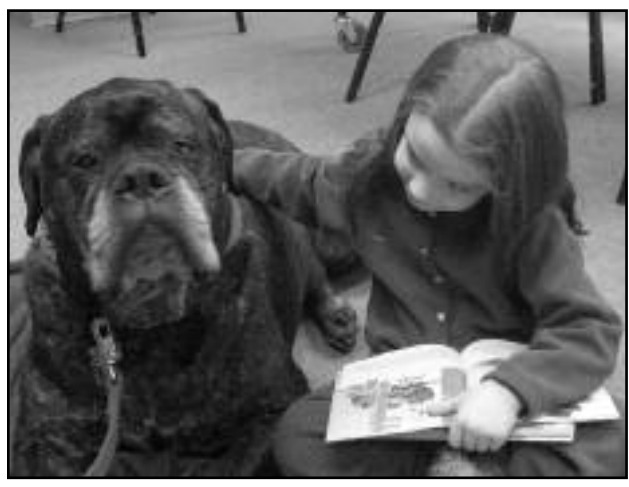
(above) Child reads aloud to a therapy dog during a Read To A Dog session

following standard loan periods: 3 days for DVDs and entertainment videos; 7 days for CDs, CD-ROMS, instructional videos and abridged audiobooks, and 14 days for unabridged audiobooks. Items not returned by their due dates are subject to an extended usage fee of $2.00 per day for DVDs, $1.50 per day for all videos and $.25 per day for audiobooks, CDs and CD-ROMs.