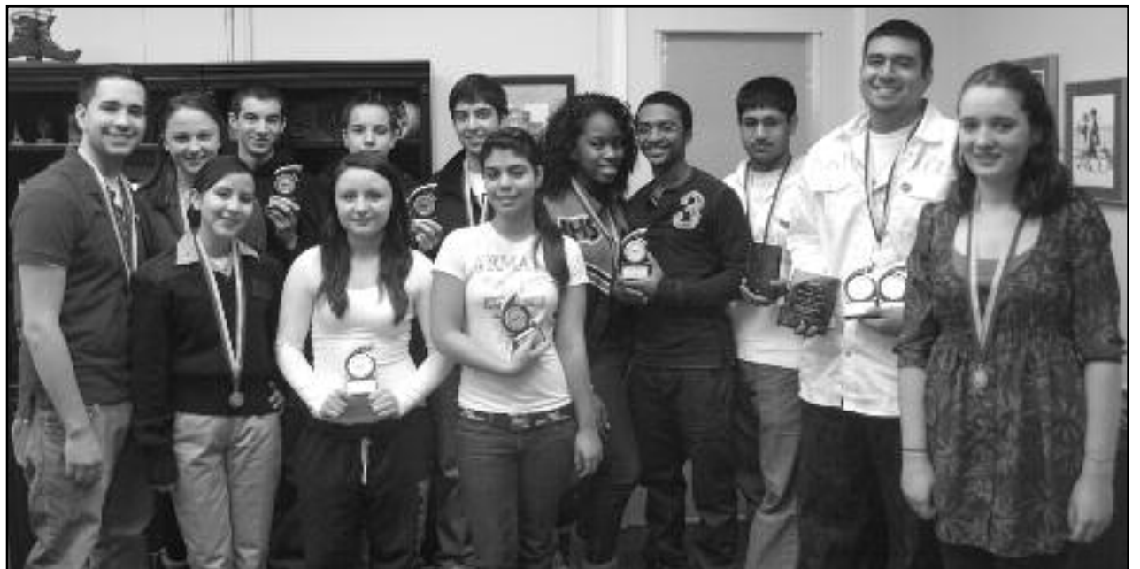
(above) The finalists in the DECA Gold Regional Competition.

DECA helps students to develop skills for successful business careers, build self-esteem, experience leadership and practice community service. DECA members create friendships with like-minded people from all over the world at career and leadership conferences and build resumes that move them to the top of the job and college application list.