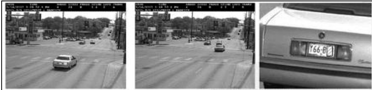
(left) First image - Before shot of violation.