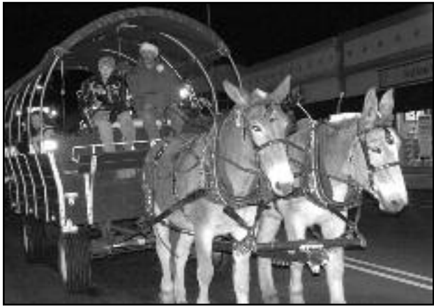
(above) Tree Lighting ceremony Buggy rides.