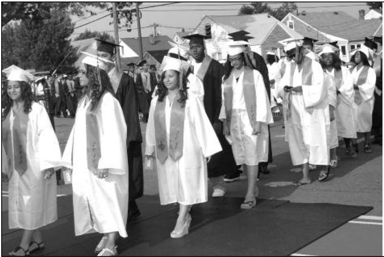
(above) The Class of 2010 at commencement ceremony.