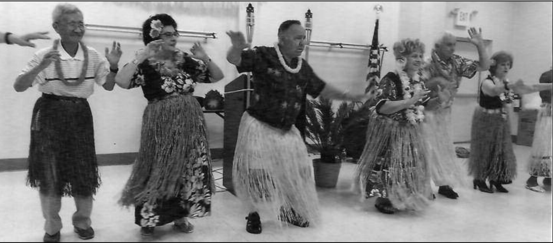
(above) Seniors show their Hula skills at the Luau.