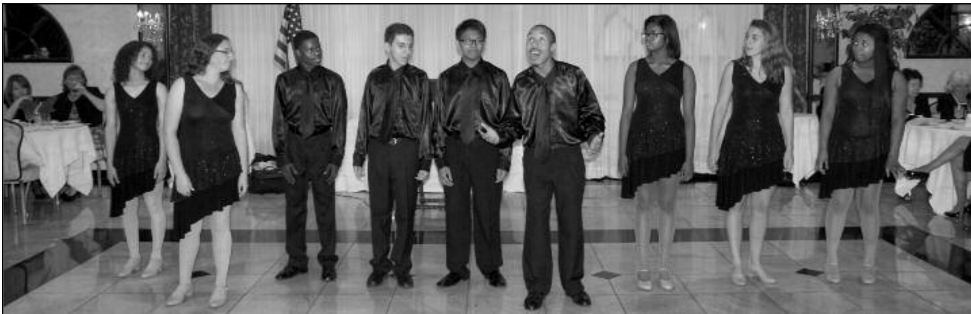
(above) Linden High School Touring Choir entertained at the Chamber Awards Dinner.