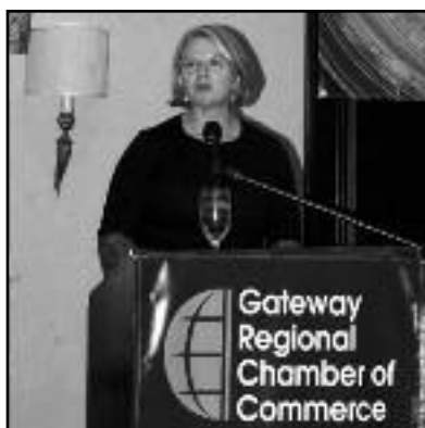
(left) Keynote speaker Margaret Spellings talks education and the future.

growth and prosperity to maintaining pace with rapidly changing technology and increased demand for physical security. Maffey's began before the first Model T rolled off the assembly line and continues to meet the needs of the most sophisticated automobiles today. From skeleton keys and padlocks to biometric access and megapixel cameras, Maffey's provides expert, innovative and reliable physical security services.