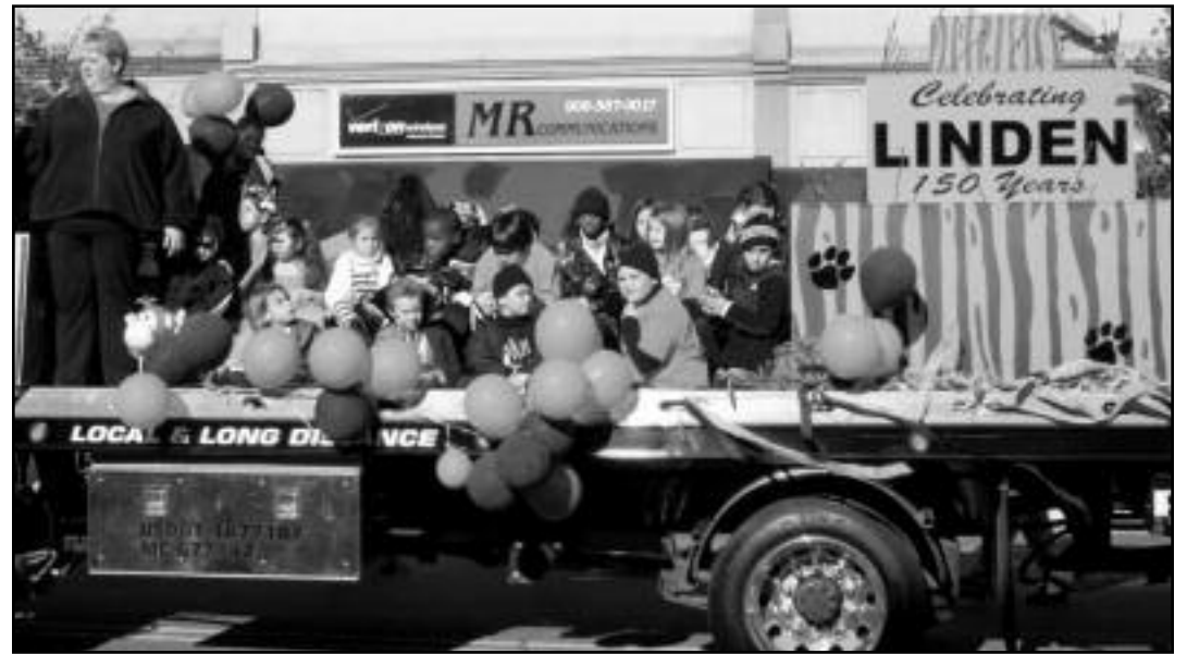
(above) Members of the 2011 Homecoming Court.