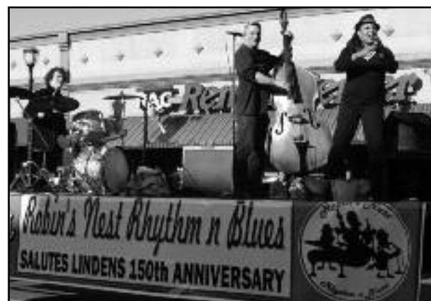
(above) Many floats included those entered by Villani Bus Company, Linden Fire Department and Robin's Nest Juke Joint.