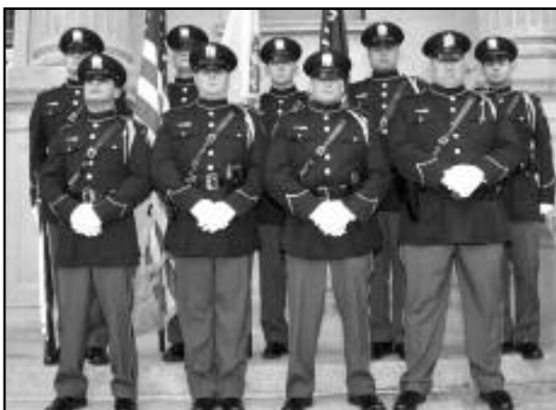
(left and below)) Members of the newly established Linden Police Department Honor Guard at a departmental inspection on September 10, 2010.

These and many more photos are available to download at http://www.linden-nj.org/police/photo_gallery.htm .