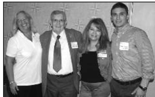
(above) Linden Chamber members manned a table at Networking Outside the Box – Supersized” – A Networking & Tabletop Show, a Gateway Regional Chamber of Commerce event held in September at the Renaissance Newark Airport Hotel in Elizabeth.