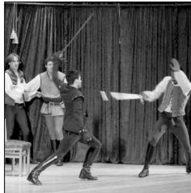
Actors from Shakespeare LIVE!, a professional touring company duel in NP HS stage. Their mission is to provide a live Shakespearean performance to students as part of the Shakespeare Theatre of NJ program.

On February 20, 2013 students had an excellent opportunity to see a professional theatre troupe perform either Comedy of Errors or Romeo and Juliet.