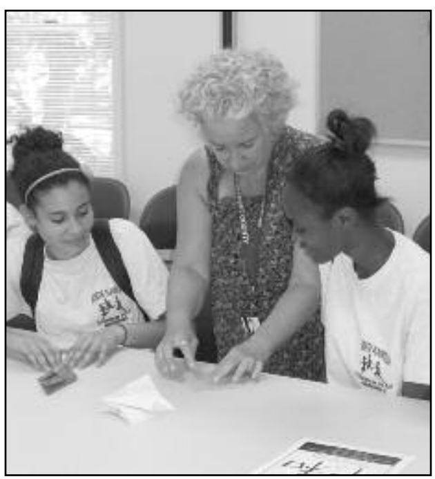
(above and right) Camp staff and counselors learn how to make Origami Cranes.

Olde Soul Cheesecakes presents homemade baked goods all made from scratch. We cater desserts for small or large events. We are also now offering farm