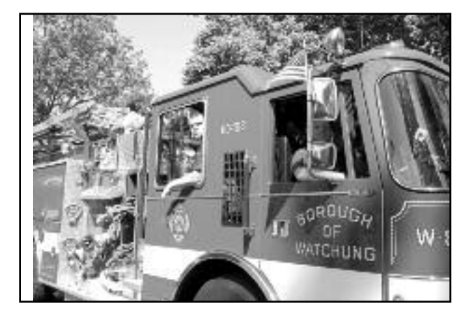
(above) Members of the Watchung Borough Fire Squad.