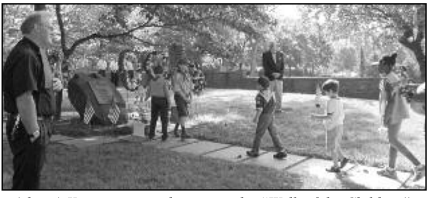
(above) Young scouts take part in the "Walk of the Children" placing flowers on a grave site in loving memory.