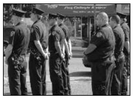
(above) Members of the NP Fire Department and EMS gather at Fire Bell Ceremony on Somerset Street.