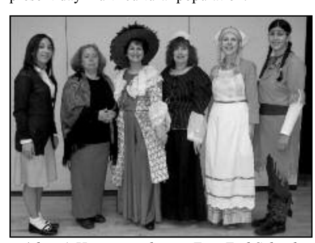
(above) History is alive at East End School.

history from Native Americans to the first children who attended East End School to the present day multi-cultural population.