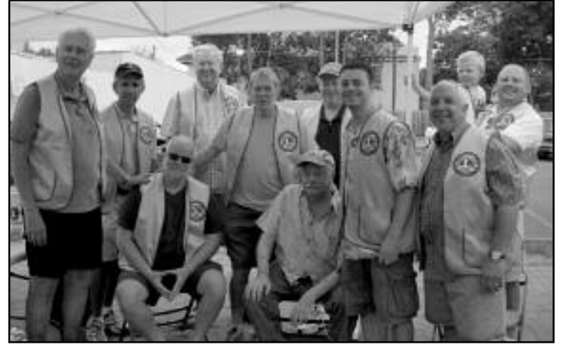
(above) The North Plainfield Lions Club hosted a beer garden at the fair.

On Saturday, June 9th, North Plainfield held and entertainment. Hundreds of residents, great celebration of the community.