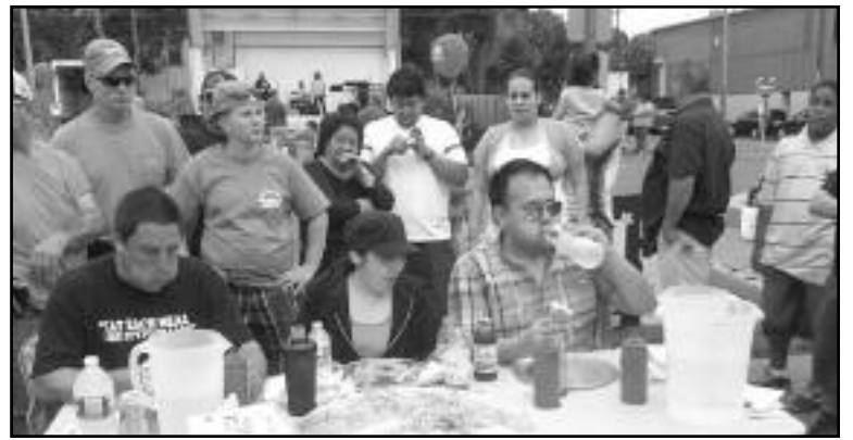
(above) Eating contest contestants