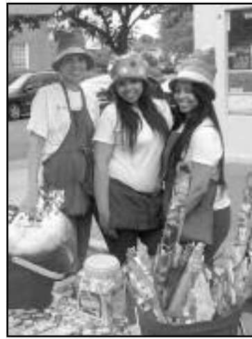
(above) Italian ice stand