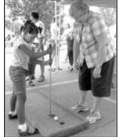
(above) Playing Golf with Friends of Vermuele Mansion.