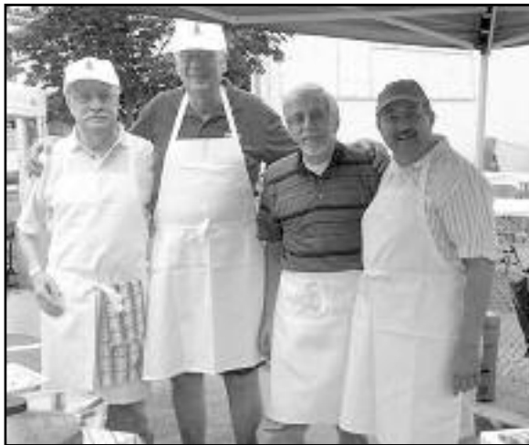
(above) Lion's Club.