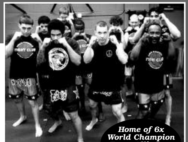
Home of 6x World Champion Team Alliance - Brazilian Jiu-Jitsu