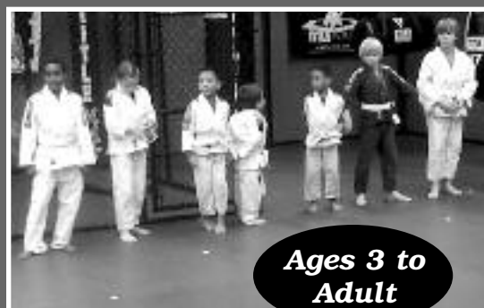
Ages 3 to Adult

Limit 1. Cannot be combined with any other offers or discount.