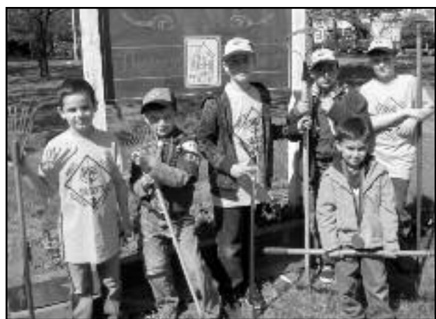
(above) Cub Scout Pack #135 in Washington Park during annual spring planting.

This is a wonderful example of North Plainfield's youth serving their community. Memorial Park is located in the Washington Park Historic District of North Plainfield. The District was established in 1868, and with a great deal of time and work by borough volunteers, was listed in the State and National Registers of Historic Places in February of 1981. This was primarily because of the unique Victorian architectural character of the homes.