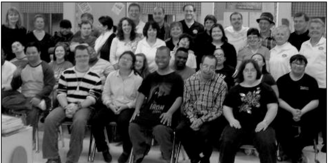
(above) The children of McAuley, their teachers and Clark UNICO members.