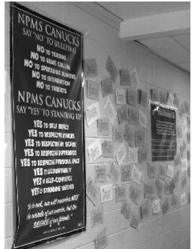
(above) The Peace Pledges hang on the Wall of Respect at NPMS.

The effort is part of a New Jersey state-wide program called the "Week of Respect." Ms. Smith says that the pledges allow the students to develop an awareness of bullying and more specifically, an awareness of behaviors that negatively impact a student's emotional and social well-being. The student pledges are displayed prominently next to the NPMS "Say No to Bullying" banner on the "Wall of Respect," as a reminder of their anti-bullying promise to each other.