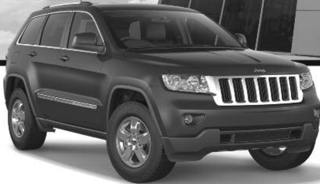
2013 Jeep Grand Cherokee