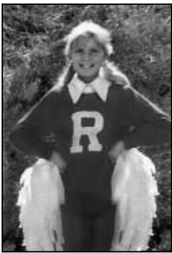
(above) At 11, a Pop Warner Football League Cheerleader!