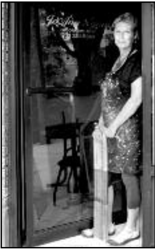
(above) In the doorway of her studio