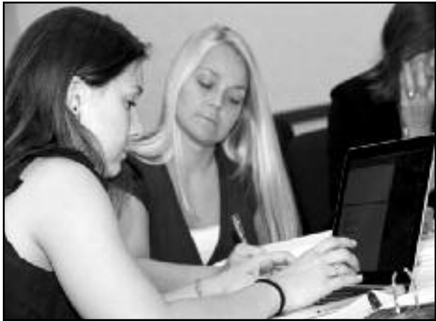
(above) Rahway teachers attend the Academy for Leadership in Science Instruction to enhance their knowledge of science and engage colleagues in providing effective science instruction for all students.

As I bring this article to closure, I am inspired to be able to ignite the minds of our youngsters and spirit of the staff to “Expect Excellence.” We must translate this sense of urgency to our students. We must seek excellence today because tomorrow may be too late.