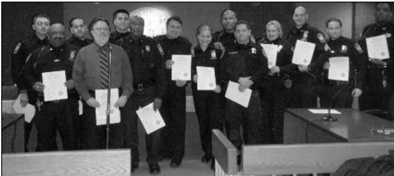
(above) Rahway Councilman Michael Cox presenting a resolution to members of the Rahway Police Auxiliary for their assistance during Hurricane Sandy. The presentation was made during the City of Rahway Council Meeting on January 14, 2013.