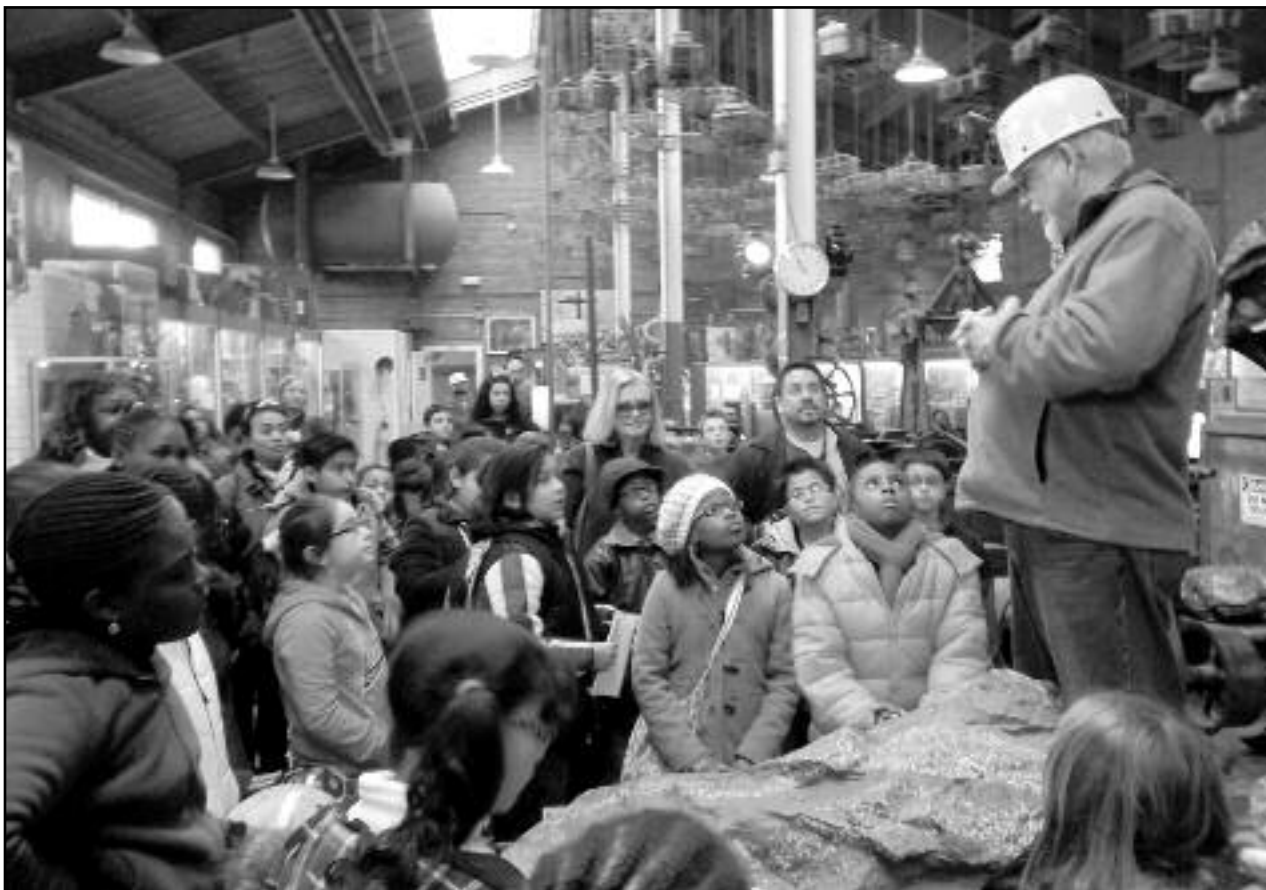
(above) Inside the mine museum, the children were enthralled with more stories about how mining took place in New Jersey.

mine, and participated in a rock discovery where each child collected six different types of rocks to keep, as well as a fluorescent one. A highlight of the trip was viewing the spectacular mineral fluorescence display in the Rainbow Room.