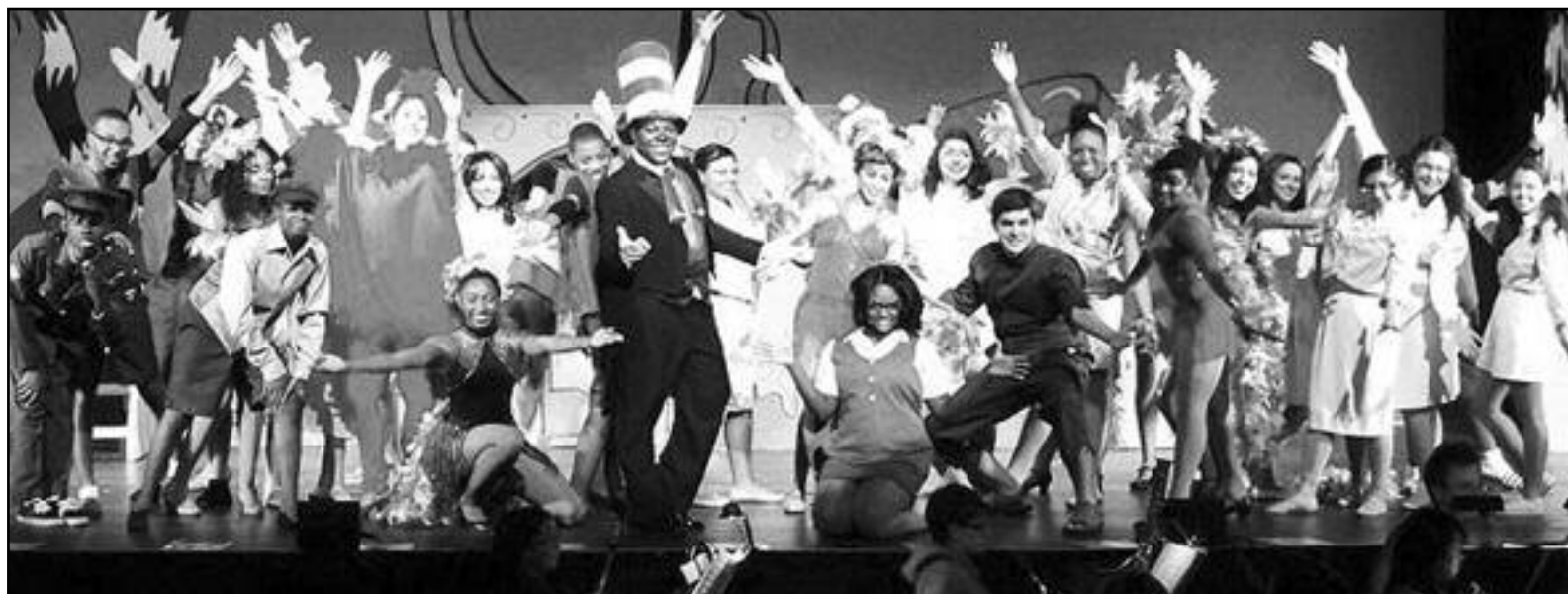
(above) The cast of "Seussical: The Musical" presented by the Rahway High School Musical Theater Class at the Union County Performing Arts Center on January 4th and 5th.

The three students will also be representing Rahway High School at the end of the month as they audition for a spot with the NJ All State Bands and Orchestras.