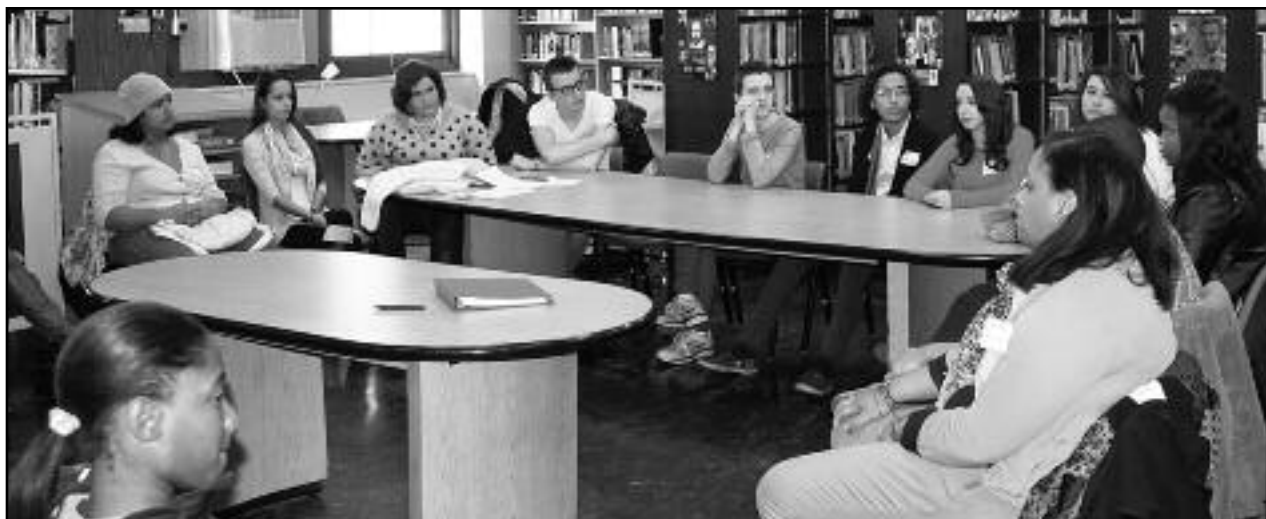
(above) Recent alumni share insights with RHS juniors and seniors at an Alumni Tea.

Most alumni had finished their first semester, but the group included alumni from 2007 to 2012. Students came from Harvard Law, Cornell University, Rutgers University, New Jersey Institute of Technology, University of the Sciences, University of Miami, Rider University, Johnson & Wales University, Fordham University, Monmouth University, and Kean University as well as a student currently doing a Gap Year who will start Amherst College in the fall and a professional dancer who is attending college concurrently. Administrators and Guidance Counselors appreciated the reinforcement of messages they have been giving all year. Hearing the same message from peers made it more likely to sink in.