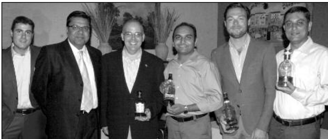
(above, l-r) Four brands of Dewars Scotch, Regular Blend, 12 year old, 18 year old and 27 year old Signature, were presented to valued customers of Metro Liquors at at III Amici's Restaurant.

It just takes a few visits to Metro Liquors for customers to get familiar with the pleasant, outgoing staff. Leaves little to wonder why Metro has such a long-lasting loyal customer base.