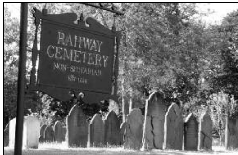
(above) Rahway Cemetery with graves dating back to 1724.

Following the Emancipation Proclamation on January 1, 1863, the recruitment of colored regiments began in full force. Free blacks and freedmen rushed to recruiting stations. Enough men would enlist to eventually fill 175 regiments which would make up one-tenth of the entire Union Army. Many African American men from this area were mustered into the 22nd, 25th, 41st and 127th regiments.