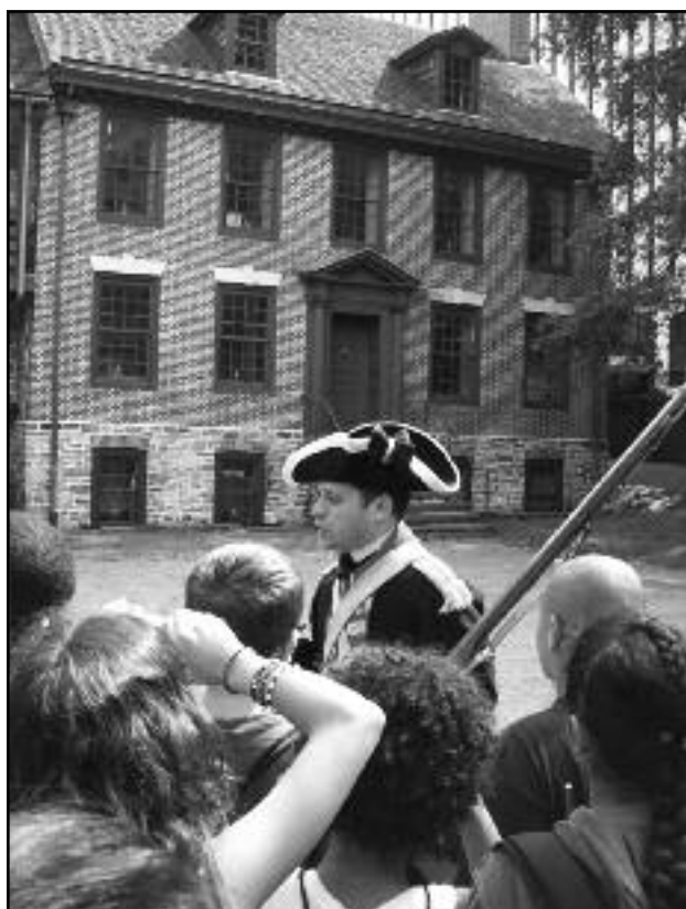
(above) 4th grade "soldiers" getting their orders in front of the Old Barracks in Trenton.

As a culminating activity to a study of the American Revolution, the fourth grade students at Roosevelt School in Rahway enjoyed a class trip to Trenton, our state capital. The children toured the State House and Old Barracks learning much about government and colonial days.