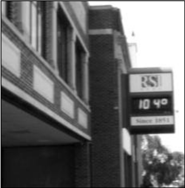
(above) RSI's electronic sign taken the afternoon of July 6th on Irving Street in downtown. Day after day of sweltering heat and high humidity.

The Rahway Police Department will utilize a new communications service, effective immediately, which allows us to send important, valuable community information directly to residents using the latest technology.