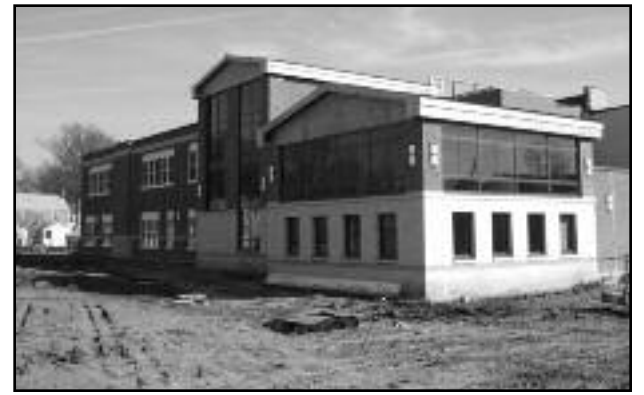
(above) New Rear Elevation of Grover Cleveland Elementary School.

The children and community of Rahway will benefit greatly from this referendum project for many years to come!