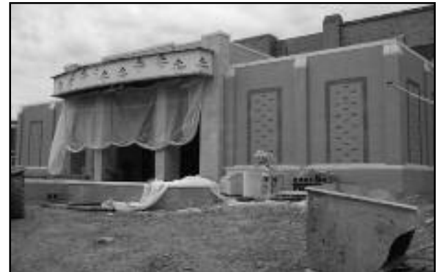
(above) New Entry for the Performing Arts Wing at Rahway High School.