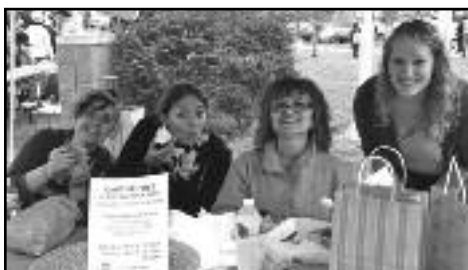
(above) Captive Free promotion.