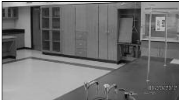
(above) New Science Lab at Rahway Middle School.