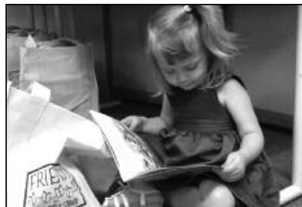
(above) A young customer test reads before purchasing.

In addition, the sale was hugely helpful in letting people know about the Friends of the Library organization. Like those bargain hunters I mentioned earlier, we too love books, and share a love of knowledge and learning. We'd love to have more like-minded individuals join us. The book sale is an enormous undertaking, with preparations, planning, sorting, and lugging