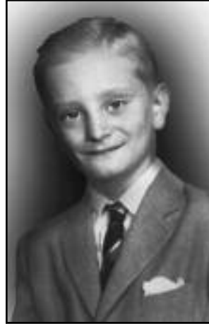
Article & Photos by Francesca Rizzo