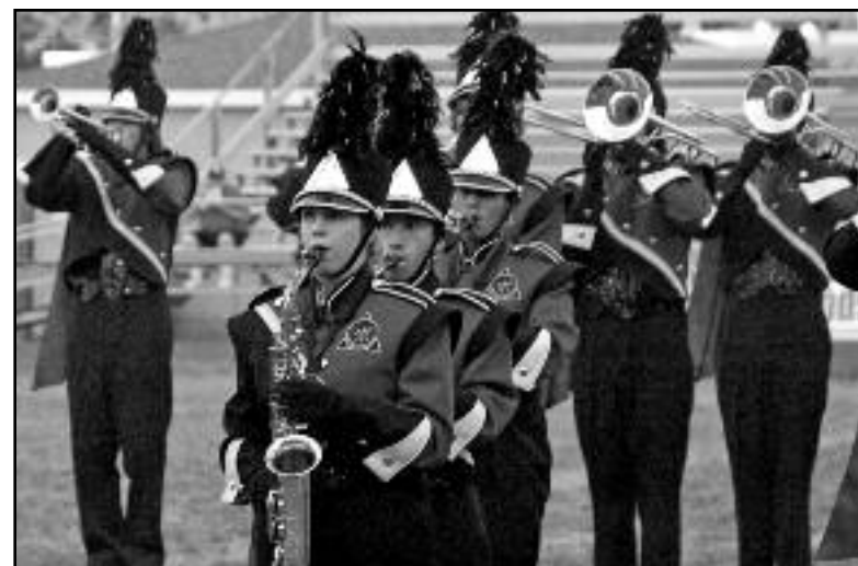
(above) Members of the Rahway High School Marching Band perform at the United States Scholastic Band Association competition at Edison High School.

The Rahway High School Marching Band finished its opening weekend of competitions at the United States Scholastic Band Association competition held on Saturday, September 11. Competing three weeks earlier than previously scheduled, the RHS Marching Band competed at Edison High School and took top honors as Best Overall Band. The RHS Marching Band took First Place in Group IVA and special awards for best music, best visual, best effect, most spirit and best pit crew. The Band then went on to top all seven other bands to win best in show.