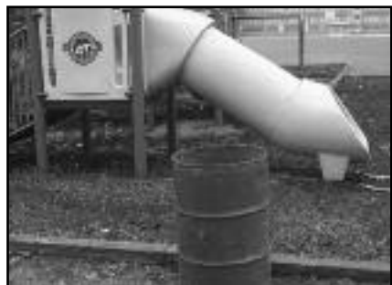
(above) Mixed Trash/Recycling Container at Rahway Playground