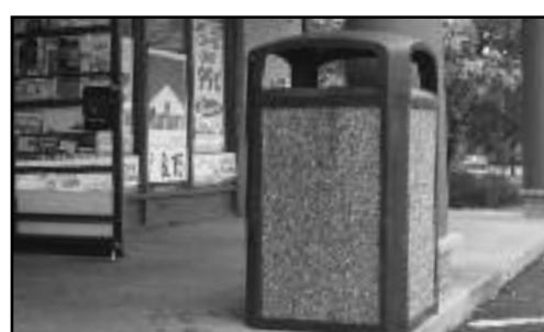
(above) Mixed Trash/Recycling Container at Rahway Shopping Center