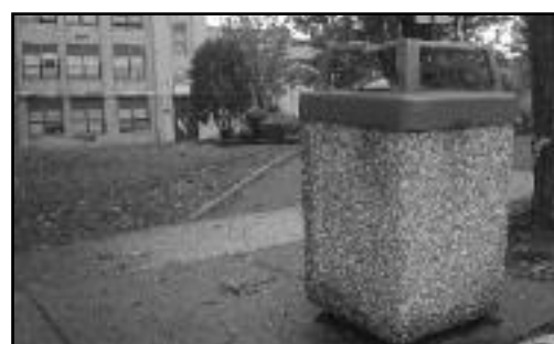
(above) Mixed Trash/Recycling Container at Rahway Public Schools