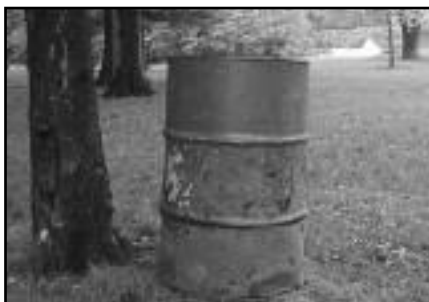
(above) Mixed Trash/Recycling Container at Union County Park