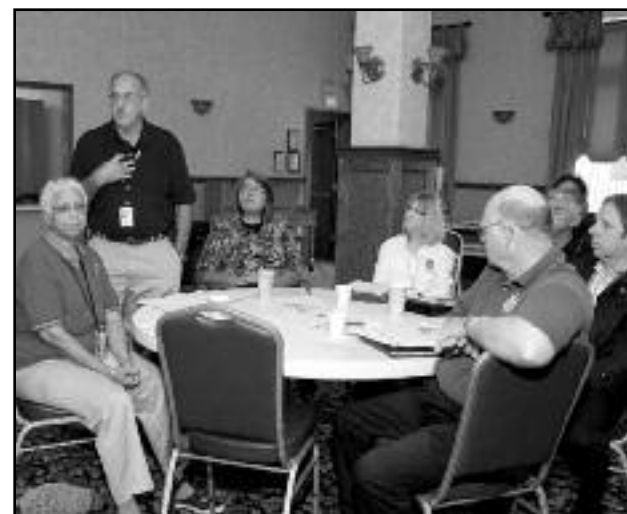
(above) the Rahway Chamber of Commerce hosted the representatives from FEMA at their September meeting.

The standard flood insurance policies from FEMA's National Flood Insurance Program have a 60-day period to file proof of loss. That deadline is Oct. 31 as well.