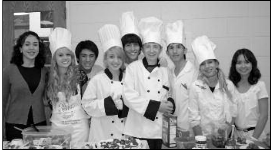
(above) Members of the Rahway High School French club take a break from their duties during Back to School Night.