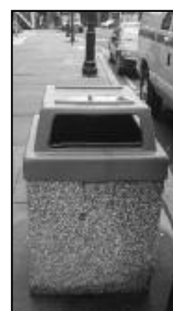
(above) Mixed Trash/Recycling Container on Rahway Streets