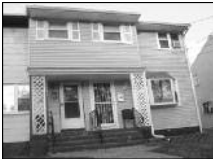
Lawrence St. $165,000

3BR 1.5B Half Duplex. New siding, windows and remodeled family room. Needs a little TLC. Priced right. Theda-732-735-3967