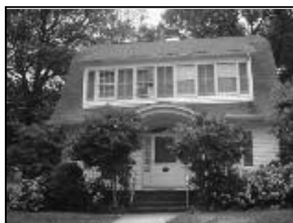
Pierpont St. $384,000

TWO FAMILY – Two 2Bedroom units. Well maintained family home with large rooms. Newer mechanics. Low taxes. Call Lynne-732-850-8810