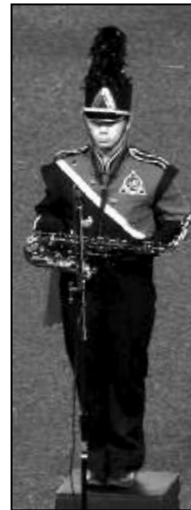
(above) In the Rahway High School Marching Band.