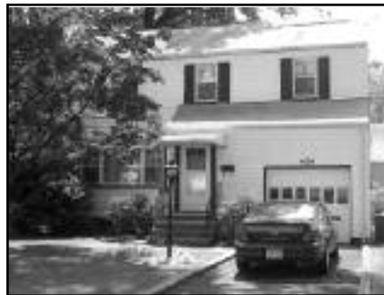
Orchard St. $285,000

3BR 1.5B Half Duplex. New siding, windows and remodeled family room. Needs a little TLC. Priced right. Theda-732-735-3967