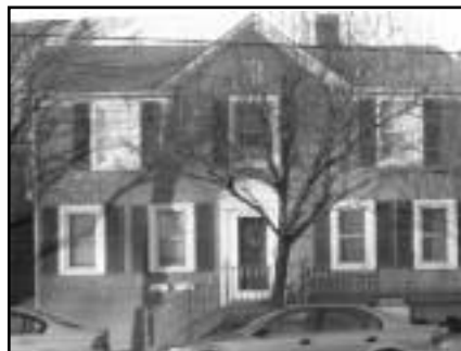
W. Grand Ave. $299,900

3 BR 1.5B Colonial with large rooms, refinished hardwood floors throughout, newer kitchen & baths. Inman Heights Section